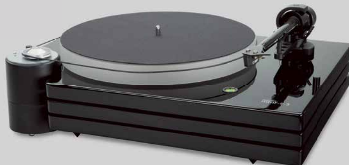
Plattenspieler mmf-9.3 Reichenmann-AudioSysteme.de